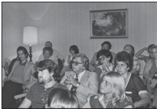
Attendees listening intently to a seminar.